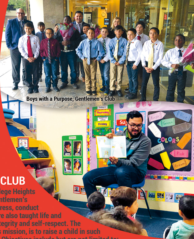
Boys with a Purpose, Gentlemen's Club

With the partnership of Bakersfield City School District, we provide Family Life Education to middle schools within the district. Students receive comprehensive Sexual Health Education and HIV prevention education from our trained instructors, utilizing Positive Prevention Plus evidence-based curriculum that complies with the California Healthy Youth Act.